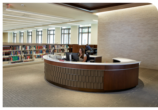
The reference desk is located on the first floor.

At the reference desk, just beyond the library's entrance, reference librarians are on duty Monday – Friday 8:30 a.m. to 5:00 p.m. to help students locate and use legal materials.