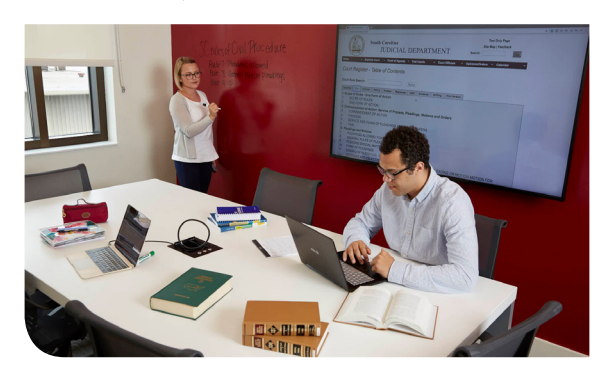
Group study rooms throughout the library are equipped with monitors and dry-erase walls.

Printers are in the Student Commons. Each student is allotted a set number of pages per academic year. When the allotted pages are spent, you must add money to your Carolina Card account. LexisNexis offers free printing of Lexis material to a designated printer in the Commons. A scanner (free) and copier (Carolina Card) are in Room 120A, near the circulation desk.