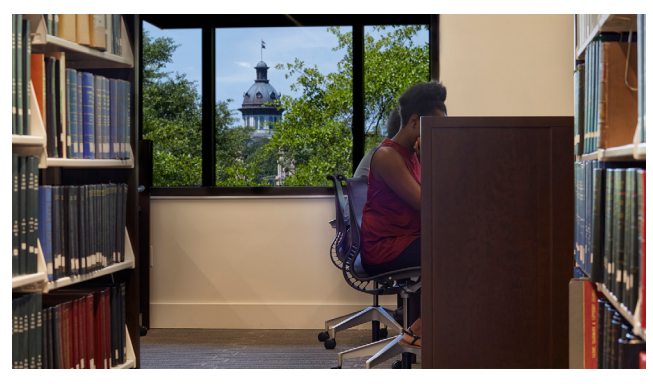
From the library's third floor, there is a perfect view of the South Carolina Statehouse peeking through the trees.